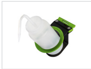
Item no. 01146