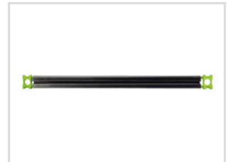
Item no. 01601

Parafilm® rolls, adhesive tapes, glove / tissue boxes, bin liner, wash bottles and kitchen roll not included in scope of delivery