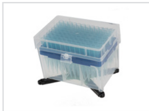
Item no. 01147