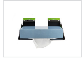
Item no. 01143