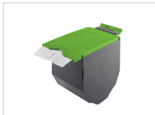
Item no. 01171