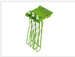
Item no. 01155