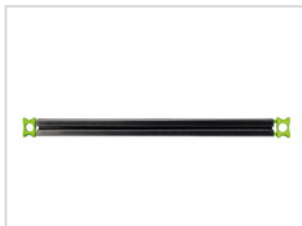
Item no. 01601

Bin liner, small accessories, laboratory screw top bottles, well plates, wash bottle, pipettes, pipette tip boxes, parafilm® roll, microreaction vessels and centrifuge tubes not included in scope of delivery