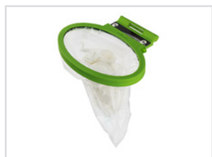
Item no. 01202