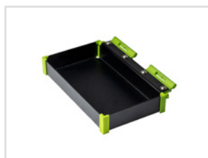
Item no. 01142