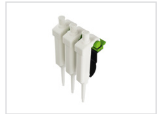
Item no. 01145