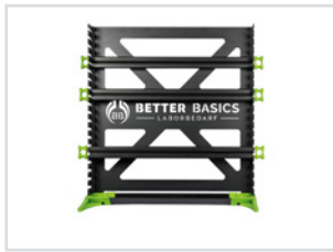
Item no. 01704

Detailed views of the individual components included: