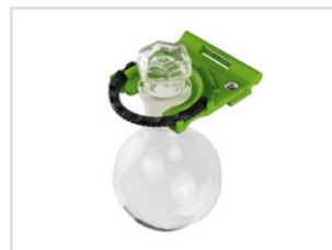
Item no. 01115