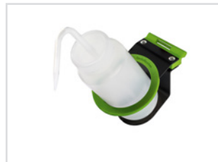
Item no. 01146

Small accessories, trash bag, tissue box, wash bottle and kitchen roll not included in scope of delivery