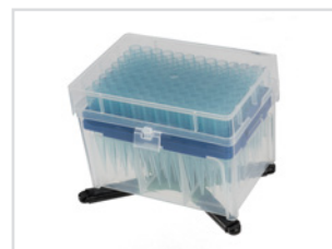
Item no. 01147