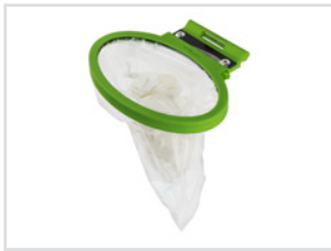
Item no. 01202