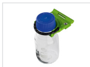
Item no. 01122