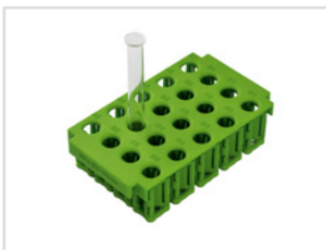
Item no. 01161