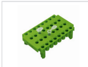
Item no. 01130