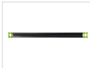
Item no. 01601

Chromatography columns, wash bottle, microliter syringes, laboratory screw top bottles, small accessories, sample containers and test tubes, glove / tissue box not included in scope of delivery