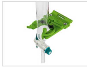
Item no. 01107