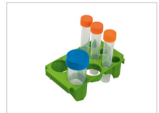
Item no. 01102