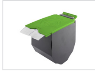
Item no. 01171