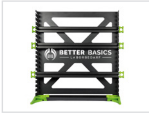
Item no. 01704

Detailed views of the individual components included: