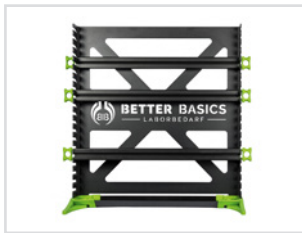
Item no. 01704

Detailed views of the individual components included: