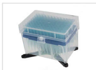
Item no. 01147