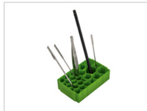
Item no. 01148