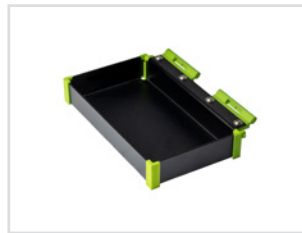
Item no. 01142