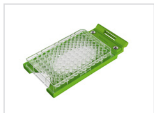
Item no. 01125

Trash bag, pipettes, pipette tip boxes, laboratory screw top bottle and well plates not included in scope of delivery