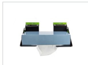
Item no. 01143