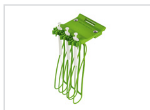
Item no. 01155

Laboratory screw top bottle, pipettes, pipette tip box and microliter syringes not included in scope of delivery