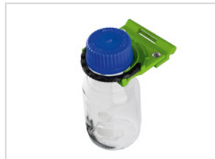
Item no. 01122