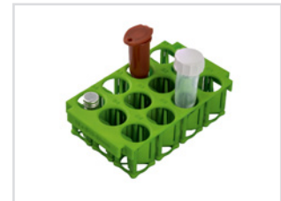
Item no. 01160