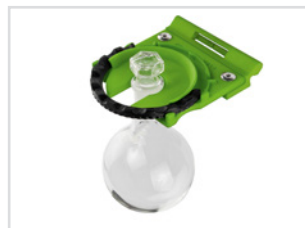
Item no. 01112