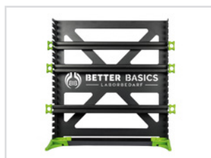
Item no. 01704

Detailed views of the individual components included: