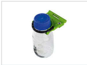
Item no. 01122