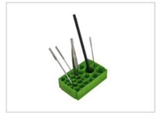
Item no. 01148