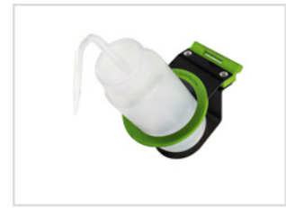
Item no. 01146