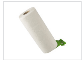
Item no. 01162