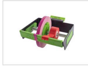
Item no. 01172