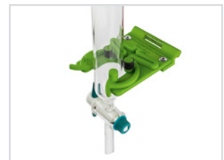
Item no. 01107