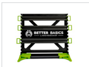
Item no. 01707

Detailed views of the individual components included: