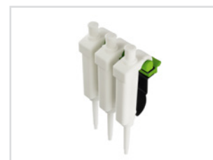
Item no. 01145