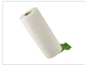
Item no. 01162